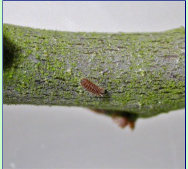
Black Hairstreak - 1st instar larva

Egg searches have shown that egg laying occurs at all heights within blackthorn scrub. No particular preference vis-à-vis oviposition sites has been detected.