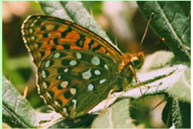
Dark Green Fritillary

A total of 22 reports in 2007 seems low compared to 10 years previously but is hard to interpret confidently. Several sites that previously held the Dark Green Fritillary did not feature but it is impossible to know if visits were made under appropriate conditions to confirm absence. There were no repeat records from various points that had returned sightings of presumed wanderers in 2006, but another record from Loosely Row in Bucks suggests a colony nearby.