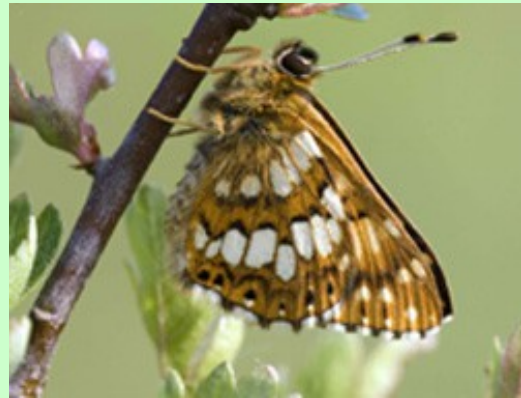
A male Duke at Ivinghoe Beacon in 2007

The Duke of Burgundy butterfly is most certainly a very threatened species locally. Butterfly enthusiasts searching for it in late May (over the years the most productive time) might have considered this year one of the worst for our local Duke populations. In fact 2007 was no worse than 2006 and might have been an improvement over last year.