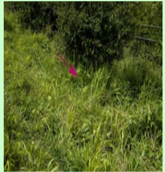
Duke of Burgundy egg-laying habitat

'Typical' egg-laying site, with 4 eggs on cowslip beneath a scrubby bush in longish but sparse grass.