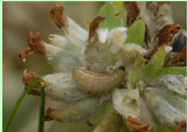
Small Blue larva

With global warming could this be a trend of the future? Certainly these late records, coupled with the early emergence, have given us the longest flight period for this butterfly in the Upper Thames region and without doubt in spite of my apprehension during the winter the Small Blue has had an exceptionally good year.