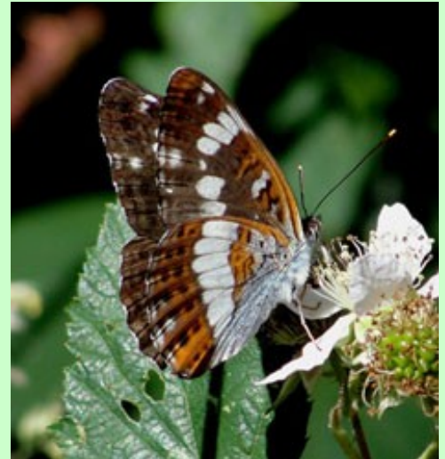
White Admiral

The first sighting was on 16th June (2009 - 16th June) and the last on 9th August (2009 - 2nd August). There were 8 occasions in June and July when daily sightings in excess of 10 were recorded. There were 95 individual sightings reported (2009 - 102) and my thanks are extended to the 39 members (2009 - 36) responsible for these invaluable records.