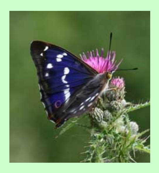
Purple Emperor m.